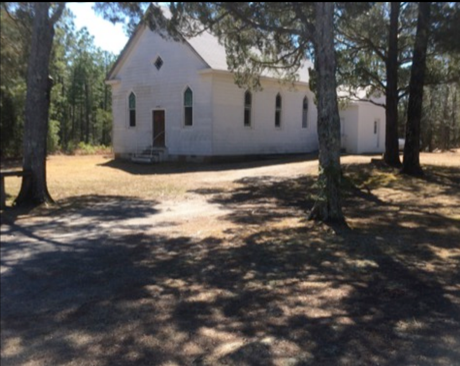
Mount Pleasant Baptist Church Oral History Project